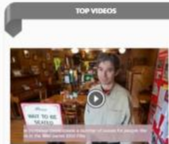
Video: Minimum wage hike may pose problems for small

Doing so would bring cooperation from the town administration and result in "an affordable housing project that all parties could be proud of."