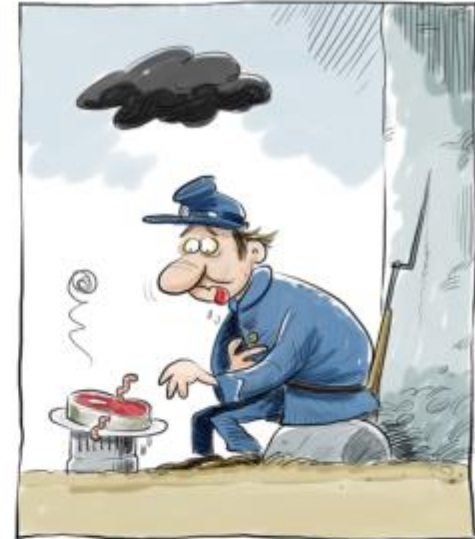
False Claims Act 1863